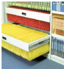
Pull out cradles