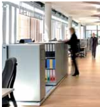
LOW LEVEL MOBILE STORAGE