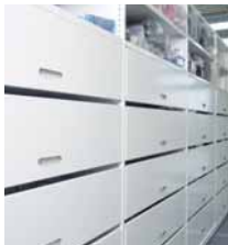
Pull out drawers