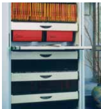
Pull out shelves